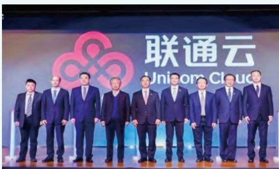
Newly released the brand "Unicom Cloud"

• In the field of cloud computing, it has supported the commercialisation of virtualization and cloud-native dual engine computing power base, and achieved a capacity of 100,000-level for its container scheduling technique.