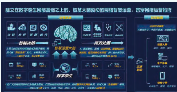
Smart Operation System Chart