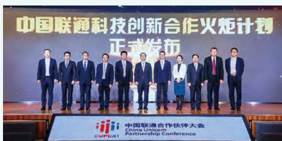
Announcing the China Unicom’s Scientific and Technological Innovation Cooperation Torch Plan

China Unicom has adhered to open cooperation and strengthened the joint innovation of industry, university, research, and application. It has released the “Torch Plan” for China Unicom’s ecological cooperation, and put forward the “1 + 3 + 5 + N” scientific and technological innovation cooperation system. While focusing on the single blueprint of scientific and technological cooperation planning, it has established three cooperation models, which are, joint research and development, strategic investment and platform cooperation. It has also provided five major empowerments, through application demonstration, scale promotion, cooperation operation, research and procurement collaboration, investment and industry collaboration. Furthermore, it has also accelerated the implementation and operation in N forms, such as forming industrial alliances, joint laboratories, developing industrial demonstration bases and getting capital support. The Company has established 7 joint laboratories with industry-leading scientific research units and universities such as Pengcheng Laboratory, Beijing Academy of Blockchain and Edge Computing, Beijing University of Posts and Telecommunications, Wuhan University and China Eastern Airlines. It has also signed 7 strategic agreements to carry out the construction of technological innovation ecosystem actively and effectively.